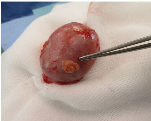
Fig. 1 Testicular sperm extraction in left testis. Incision of tunica albuginea and pulpa of testis can be removed with scissors

Sperm retrieval rates with TESE are significantly higher than that with aspiration [10–12]. Microsurgical skills are not necessary, and the procedure can be performed quickly in local anesthesia in the surgeon's office or even in an intensive care unit [13]. Using TESE and micro-TESE, complications such as inflammation, infection, or local hematoma with impaired testicular blood flow or even complete devascularization of the testes are possible [14].