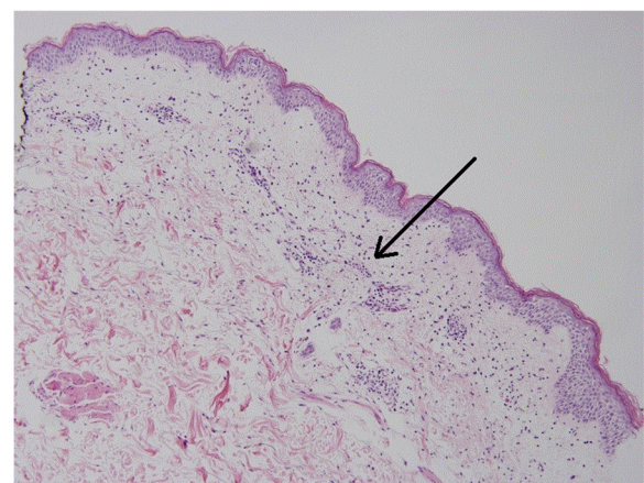
Fig. 2 Histopathology of skin biopsy revealing spongiotic epidermis with focal parakeratosis, exocytosis, and spongiotic vesicles, along with papillary dermal edema, superficial dermal perivascular inflammatory infiltrate, and mixed dermal interstitial inflammation with eosinophils (H&E, \times 10 ). The arrow points to the "papillary dermal edema and superficial dermal perivascular inflammatory infiltrate"