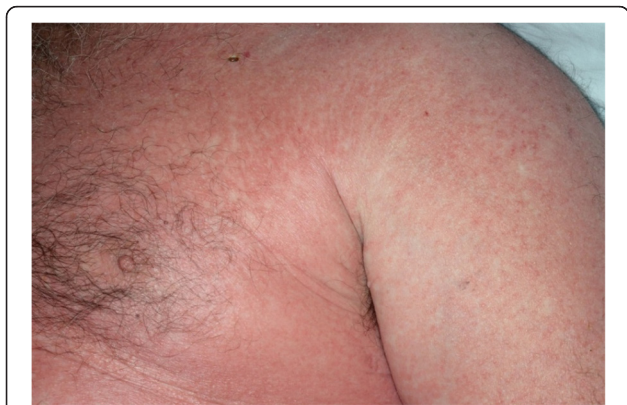
Fig. 3 Day 4 of hospital admission, after initiation of systemic steroid therapy. Significant regression of skin eruptions noted

Our case has several unique features. First, the onset of AGEP was delayed for a couple of weeks after